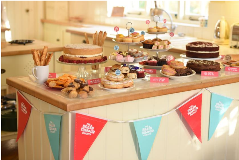
Charity Bake Sale